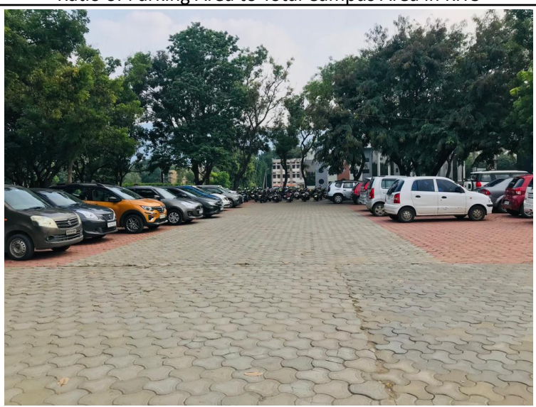
Example of Ratio of Parking Area to Total Campus Area in KITS